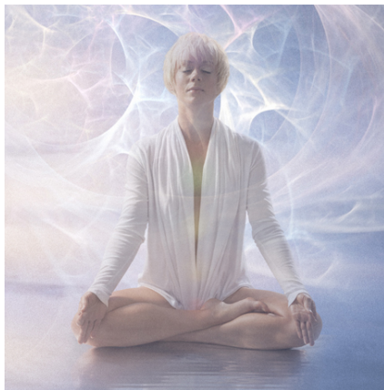
Liquid Mind X: Meditation is the tenth release in the series.