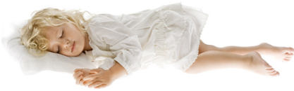
Liquid Mind IX: Lullaby is the ninth release in the series.

Liquid Mind ® is the name used by composer/producer Chuck Wild for his series of fourteen best-selling ultra-slow music albums, which have been dubbed "zero beat" as there is no regular beat or rhythm. Listeners often experience deep relaxation while listening to Liquid Mind.